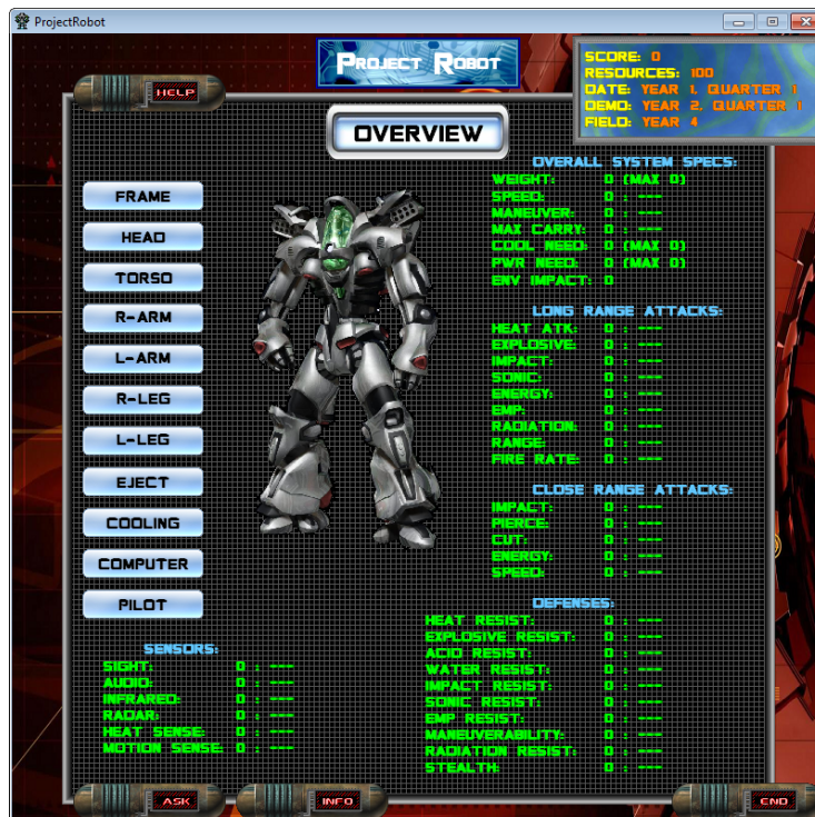
Figure 3: Project Robot Overview Screen

The player is able to manipulate the robot’s design through interaction with the overview screen (Figure 3) and other related screens. The overview screen shows the overall system specifications and attributes according to its current design, and allows the player to select different parts of the robot to enhance, change, or build.