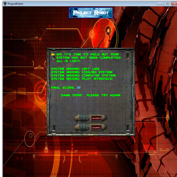
Figure 5: Failure Screen

The game ends after the full 22 turns (Phase One, development phase, plus Phase Two, maintenance phase), and at that point the player is given a final score. The game ends in failure if the player has not selected all sub-systems by the maintenance phase (Figure 5); without all sub-systems (head, legs, engine, etc.), the robot cannot operate and thus has failed. If the player has selected all sub-systems, then poor systems engineering decisions, such as failing to spend resources to boost confidence in sub-system interfaces, simply result in a lower final score.